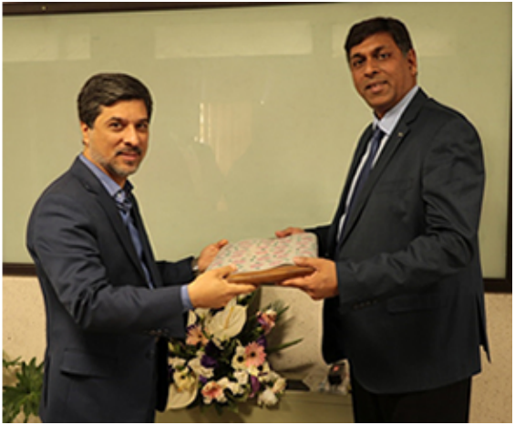
Iran Technical and Vocational Training Organization.