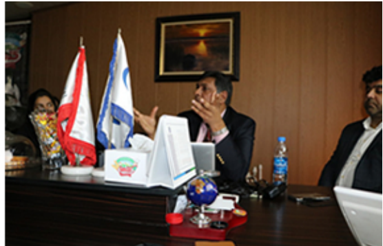
Golha Food Industry Complex, na IRIP member.

IRIP also arranged some official meetings with Governmental Organizations to improve IRIP's activities in field of education and training. REspective pictures below: