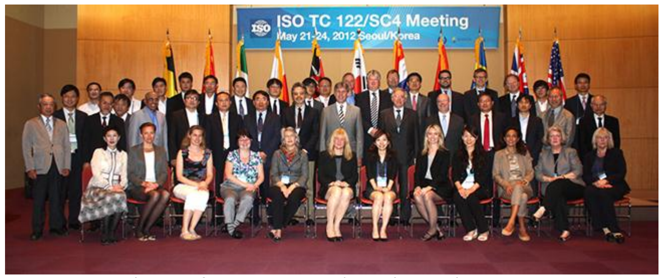
The Group of ISO Committee TC122/SC4 Packaging and Environment