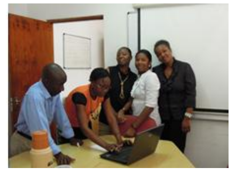
IPEX staff undergoing training, demonstration and practice session on retrieving information for the exporters.