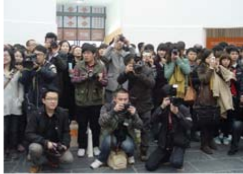
WorldStar Awards - Gallery Opening Enthusiastic Students