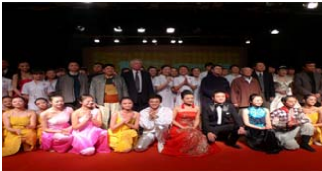
End of TheWPO WorldAtar Programme Concert participants and honored guests