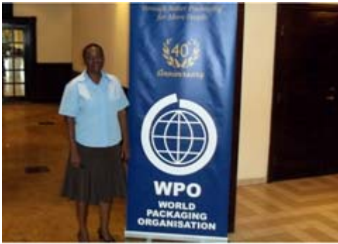
WPO in Tanzania Entrance to cocktail function

The next few months should see some activity in the putting together the committee and planning for the inauguration of TIP. Another great achievement of WPO in spreading and improving packaging around the world, specially in regions that need it most.