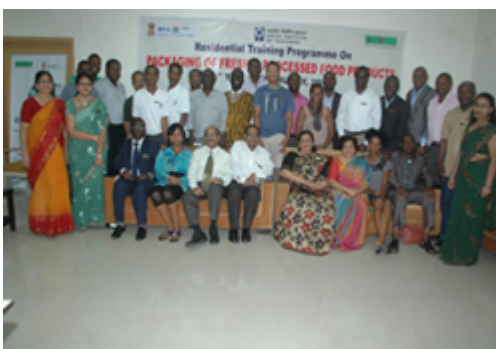
Group picture of participants

The two week program had a lasting impression on all participants looking at the in-depth knowledge acquired as well as the incredible cultural experiences they were exposed to. It is our belief that this partnership between India and African would continue in order to develop the capacities of African professionals in fields such as packaging technology.