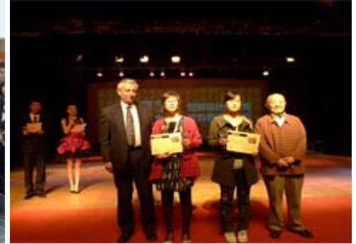
WorldStar Student Competition Winners – Best in Class