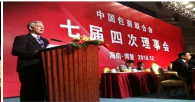
WPO President at China Packaging Federation's 30th Anniversary Congress Dec 2010