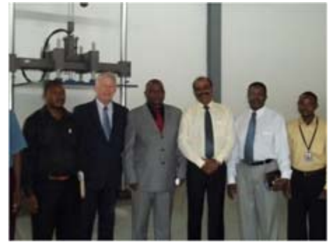
WPO President visiting the Tanzanian Institute of Standards