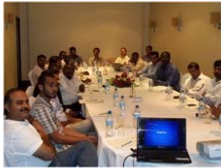
WPO in Tanzania - business leaders at presentation